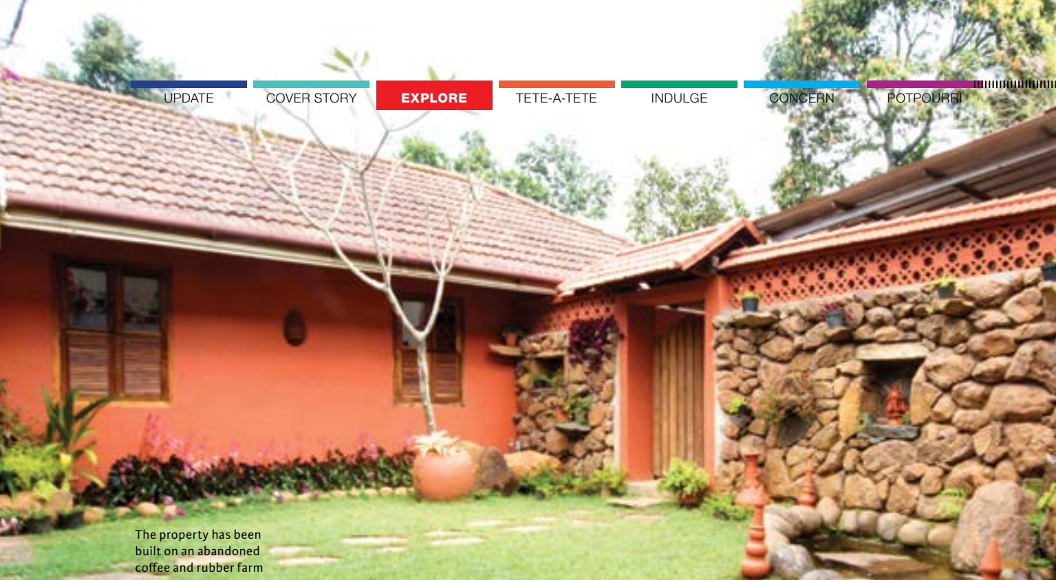
The property has been built on an abandoned coffee and rubber farm

Furnished with old world rosewood furniture, this is the perfect space to de-stress and the verandah adjoining the room is an ideal place for you to reconnect with yourself over a cup of morning tea or coffee.