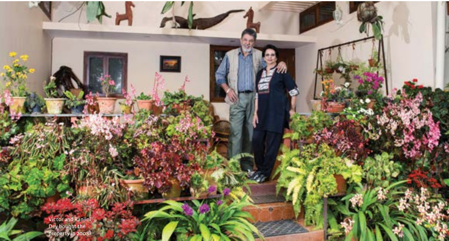
Victor and Ranjini Dey bought the property in 2008