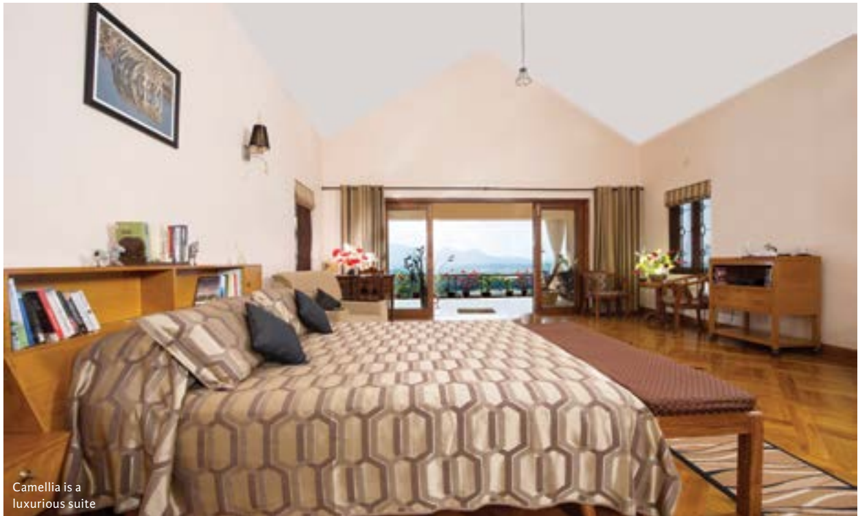
Camellia is a luxurious suite