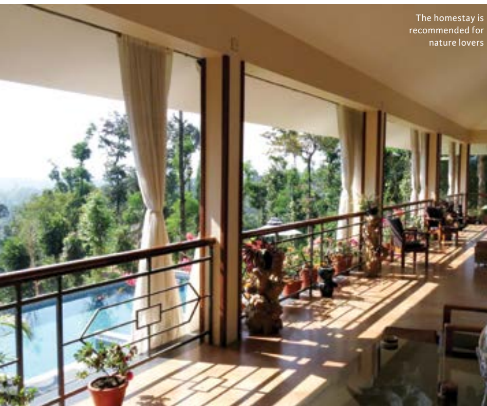
The homestay is recommended for nature lovers

verandah, from where the views of the lush countryside below are unmatched. The L-shaped private terrace offers you the space to relax and unwind and enjoy the breathtaking view of the meandering waters of the Karapuzha Reservoir, with the Velaranmalai Hills beyond. The spectacular sunset is a must-see from here and the en-suite bathroom with its spacious jacuzzi adds to the luxe experience.