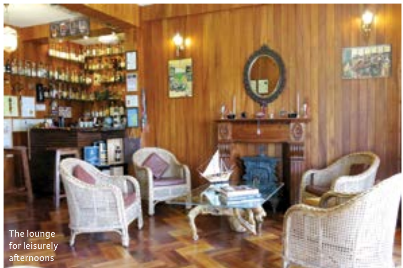
The lounge for leisurely afternoons

A tour of the property is highly recommended. It has a wide variety of fruit, spice and flowering plants and trees. There are also many different types of birds that you can spot on the property