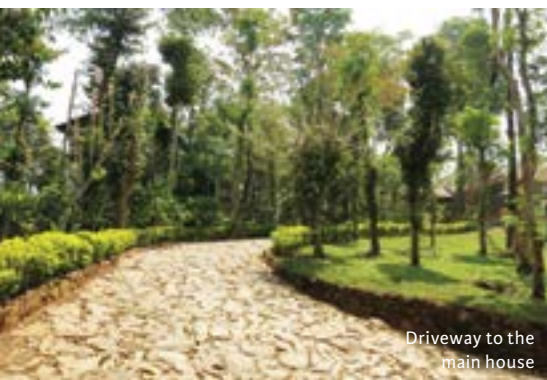
Driveway to the main house

All the rooms are named after flowers that grow on the property. The Terrace Suite (Camellia), a super luxurious and elegant room with a view, has polished wood floors that accentuate the white cedar furniture. The large glass doors open up onto a spacious