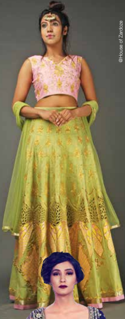
@House of Zardoze