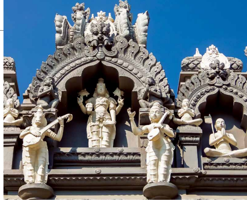
Carvings at Sri Venkateswara Museum of Temple Art

Located about 60 kilometres from Tirupati, the Sri Kanipakam Vinayaka Swamy temple is renowned for its self manifested idol of Lord Ganesha. This is also amongst one of the rare temples of Lord Ganesha as the devotees believe the idol here is growing.