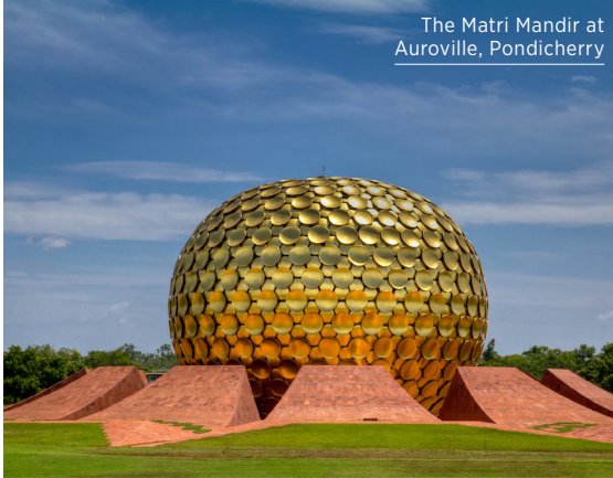
The Matri Mandir at Auroville, Pondicherry