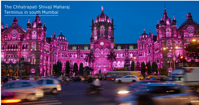
The Chhatrapati Shivaji Maharaj Terminus in south Mumbai

Among the touristy attractions here are colonial buildings, some going back to the 18th century; and the sprawling premises of the famous Sri Aurobindo Ashram; and Auroville, the international City of Unity. Pondicherry has a wide choice of hotels to choose from: beach resorts for tourists and families, heritage hotels for those who want to experience something out of the ordinary, high class commercial hotels for the corporate visitors and the neat ashram guest houses for the spiritual seekers.