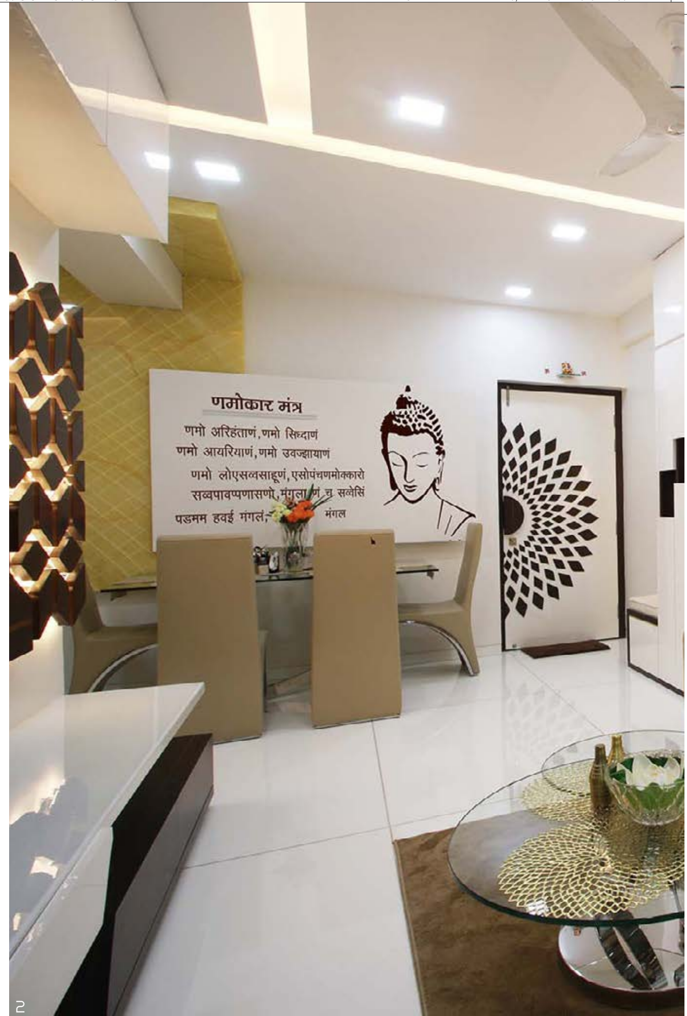
Drawing room in harmony of parallel line with petal abstract form being charm.