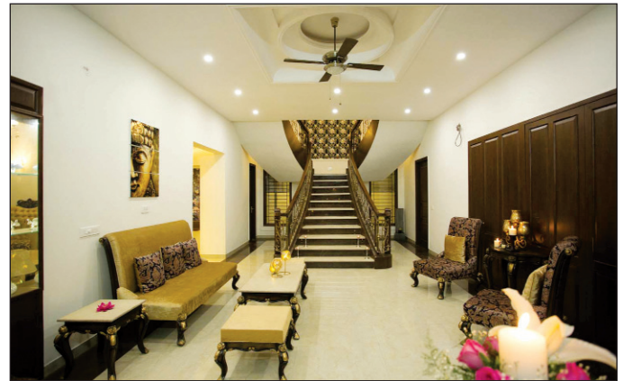
The interiors of a palatial bungalow

want to retire from mundane work, unpleasant circumstances and political gimmicks but I would still want to continue to contribute and share my knowledge and experience."