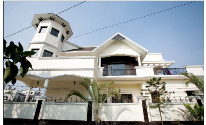
Residence of the ex district magistrate designed by Panjwani Architects

“ GEOMETRY, BALANCE, SCALE, PROPORTION, AND BEAUTY ARE ALL PRESENT IN NATURE. WE ARE SURROUNDED BY PERFECT ENGINEERING AND DESIGN