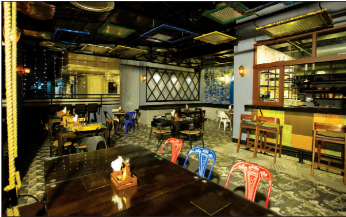
The restaurant interiors of Zion