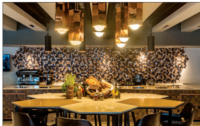
By The Waterside