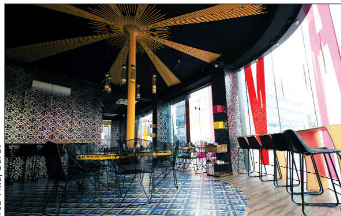
Tea Villa, Surat

original furniture that they retail through their latest outfit - Smalshop. Design Studio, their in-house design space is where they design art and installations for events