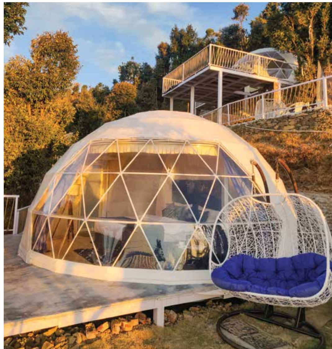
➤ Unlike conventional hotels, glamping is a unique endeavour that demands a willingness to venture into the wilderness

the waterfall on one side and an infinite valley view on the other. It became an instant hit. Then, in 2023, we introduced an equally mesmerizing location in the village of Poopara (Munnar, Kerala), right amid cardamom plantations and surrounded by mountain, valley, and lake views. There, we offered what is till today the only Bubble Glamp location in India. At Luxeglamp, we strongly believe that Mother Nature is our greatest luxury and we consistently strive to protect and preserve this. You will not just find nature with us, you will find calmness, serendipity, and a glamorous way to relish the beauty and magnificence of nature."