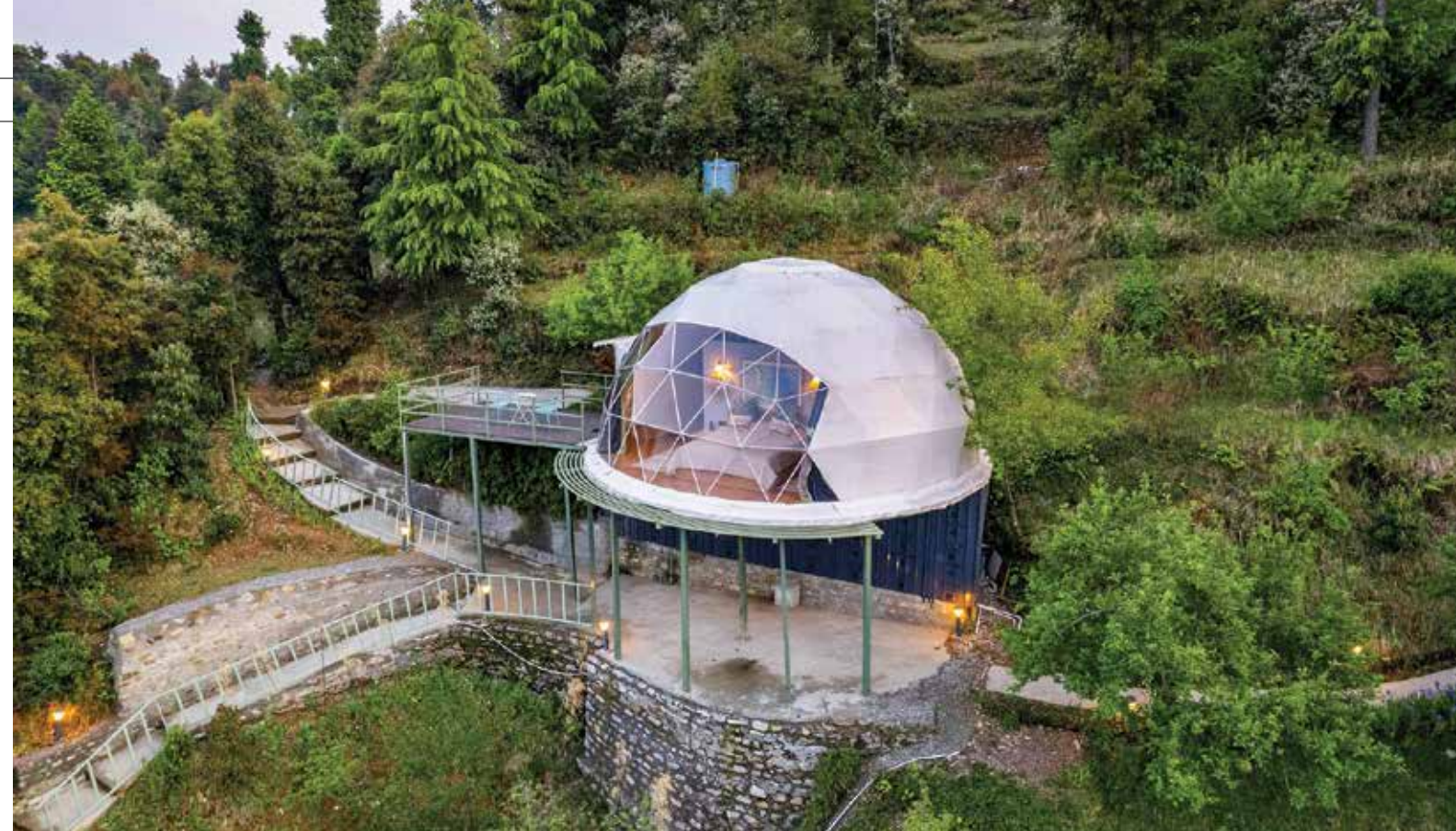
➤ Glamps are usually situated in secluded pockets of nature.

Unlike conventional hotels, usually found along bustling roads, glamping is a unique endeavour that demands a willingness to venture into the wilderness. Situated in secluded pockets of nature, glamping requires traversing a path less taken, embracing solitude, and relishing the openness of the surroundings. This distinctiveness imparts an unparal-