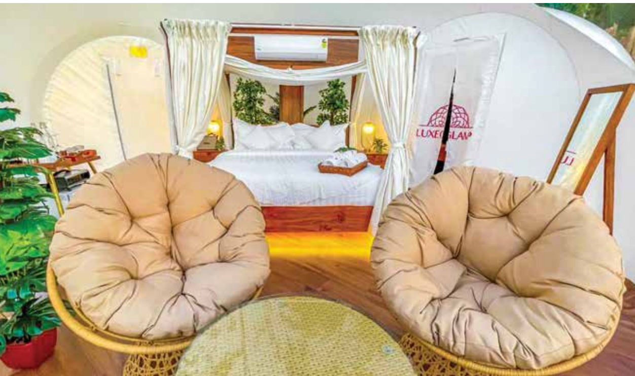
➤ The surge in glamping's popularity across India can be attributed to the contemporary thirst for novel experiences