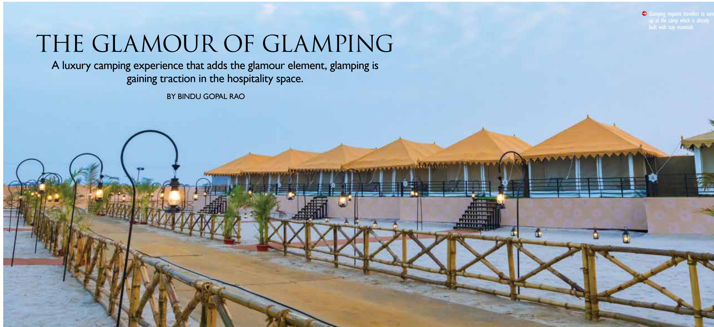
➔ Glamping requires travellers to turn up at the camp which is already built with stay essentials