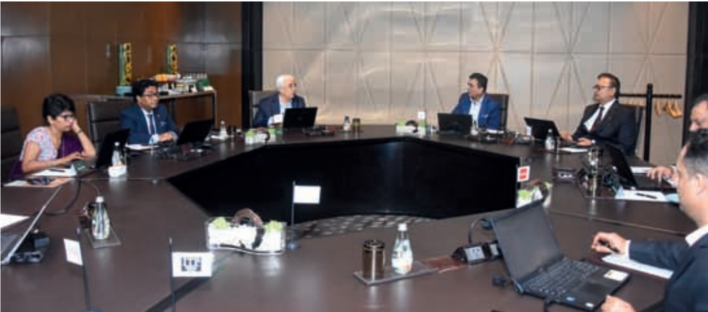
• Jury members from Group One assessing the nominations