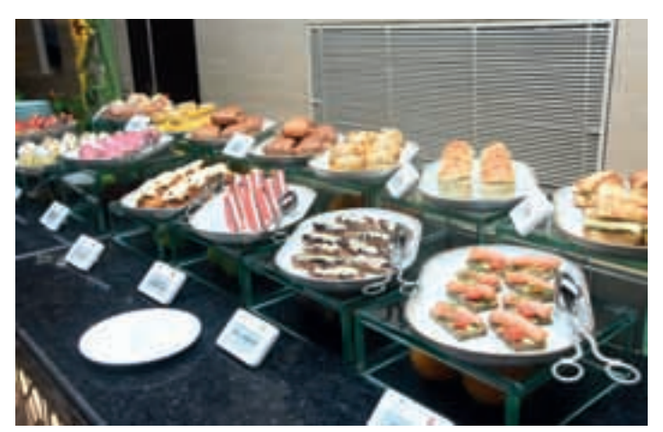
• Delectable spread of food dished out by the F&B Team of the hotel

tion or manual mistake. The camaraderie, the sense of competition, the detailing with which we are going through every single candidate is also very exciting and endearing."