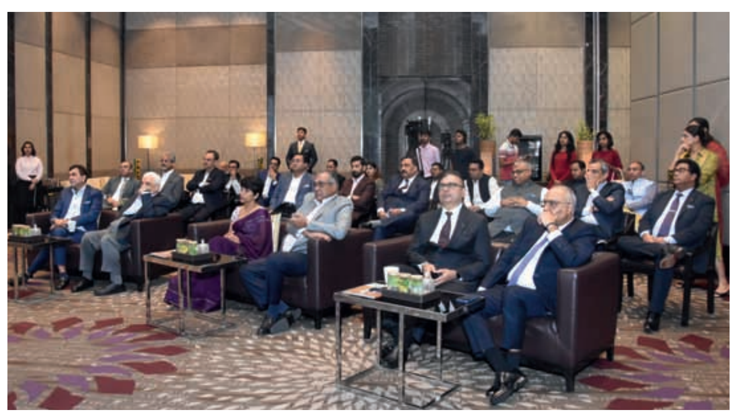
The Grand Jury assemble at JW Marriott's Royal Ballroom