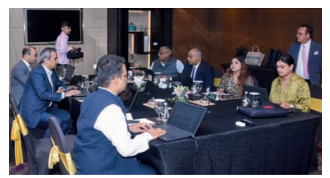
• Group Two members judging the entries, assisted by Team ITP Media India