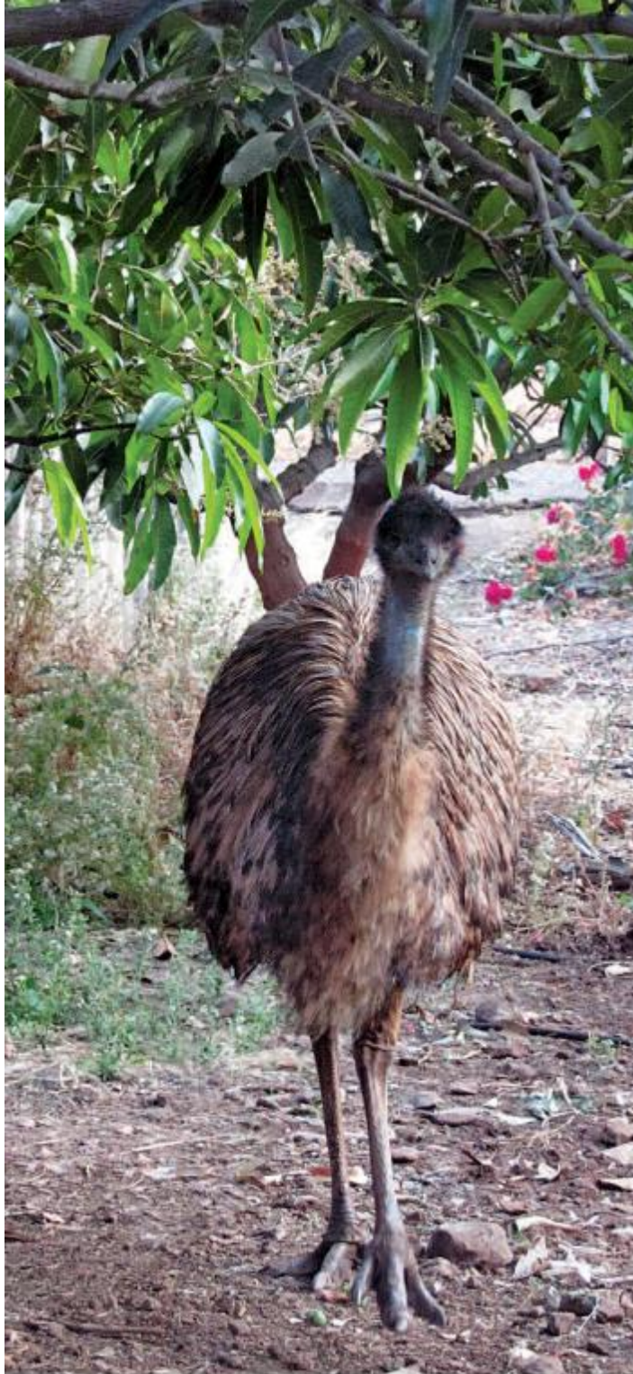
(From far left) The beauty of the vineyard at Akuj is comparable with vineyards anywhere in the world; visitors can see omis here. This one peers curiously at the camera.

park, an amusement park, a children's park, boating and a safari park, there is no dearth of options here. A must-see here is the Mamacha Wada (meaning maternal uncle's house), a display of a traditional Maharashtrian house. The entire model village recreates life in rural Maharashtra and is ideal for both children and adults to experience village life first-hand.