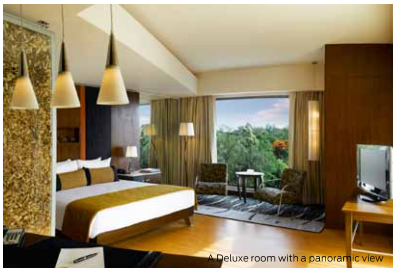
A Deluxe room with a panoramic view

The O Hotel in Pune's upmarket Koregaon Park is an eclectic mix of design, colour, lighting, art and music, set against a contemporary and chic background. By Bindu Gopal Rao