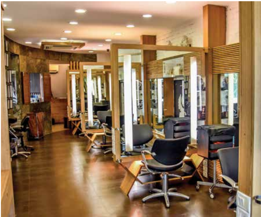
Disclaimer: All images used are for representative purposes only