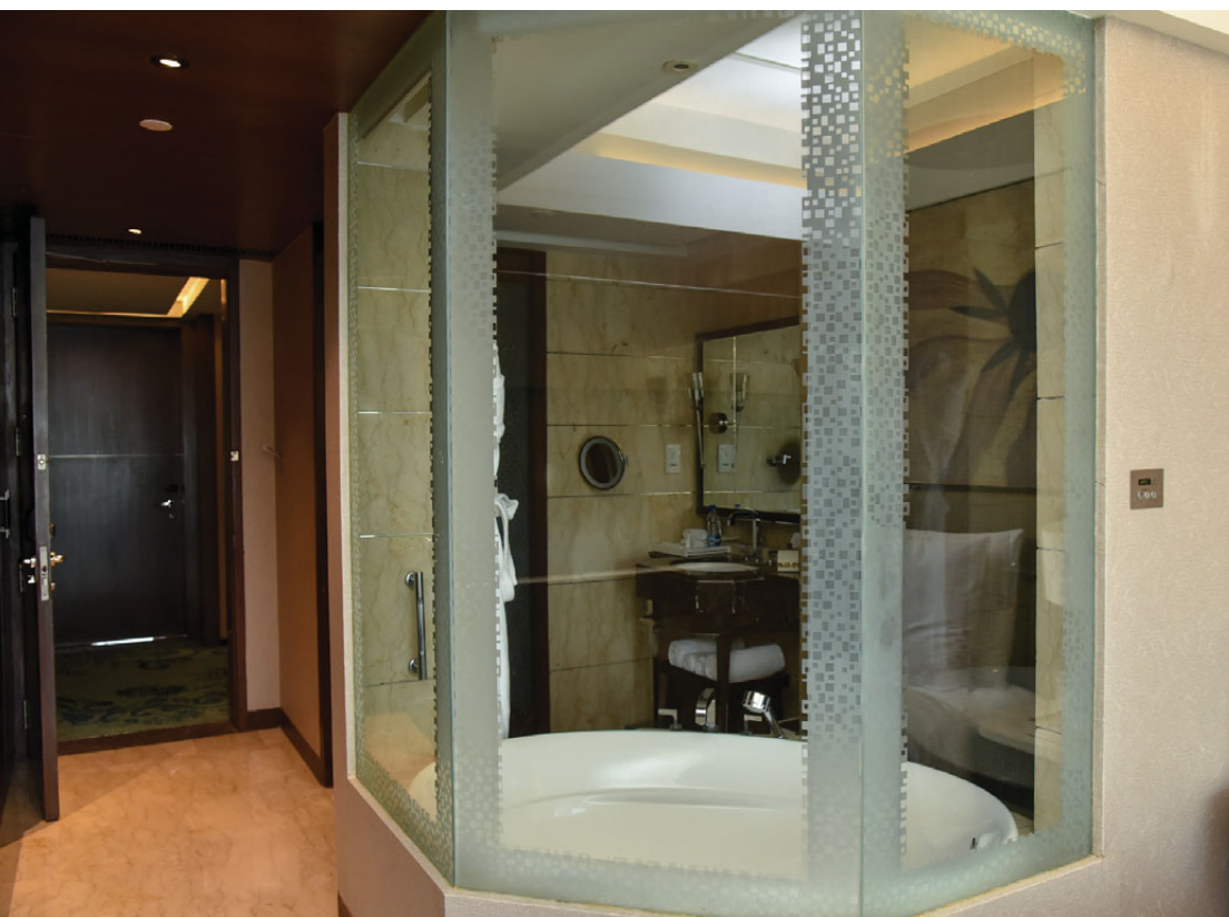
➤ The Leela Ambience Convention Hotel, Delhi.

vide the best and easy-to-use facilities in bathrooms. These facilities are extremely important, as according to an executive housekeeper, no guest wants to start their day with a lesson on how to use various faucets, spouts and bidet fittings. While sharing the brief to the architect planning and designing a hotel's guest bathroom, hoteliers look for functionality in terms of proper layout, right circulation space, spacing between fixtures and fittings, segregation of wet and dry areas and the like.