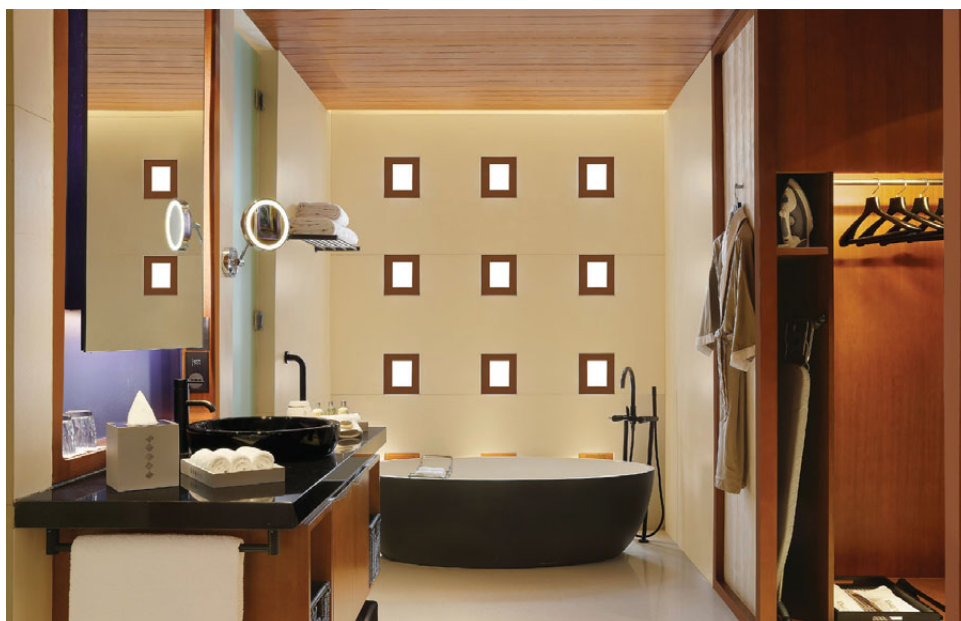
➔ InterContinentalChennai Mahabalipuram Resort_Resort Deluxe.

for example, changes colour to the whole ambient, shaping diffused chromatic lines to produce a soothing effect of the bathroom environment. The system is controlled by a touch-screen with simple and intuitive interface controlling water functions, colour changes, music and videos. The music is easily uploaded by connecting an i-Pod to a wall-mounted USB port, while the speakers are ceiling-installed. The