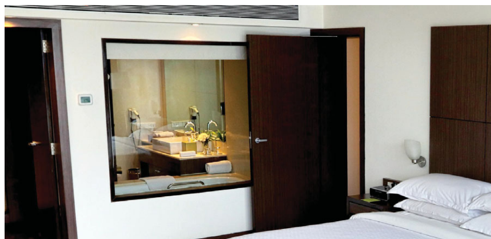
➤ bathrooms from Four Points by Sheraton, Navi Mumbai.

Unlike in a room, a bathroom is an area where there is very little room