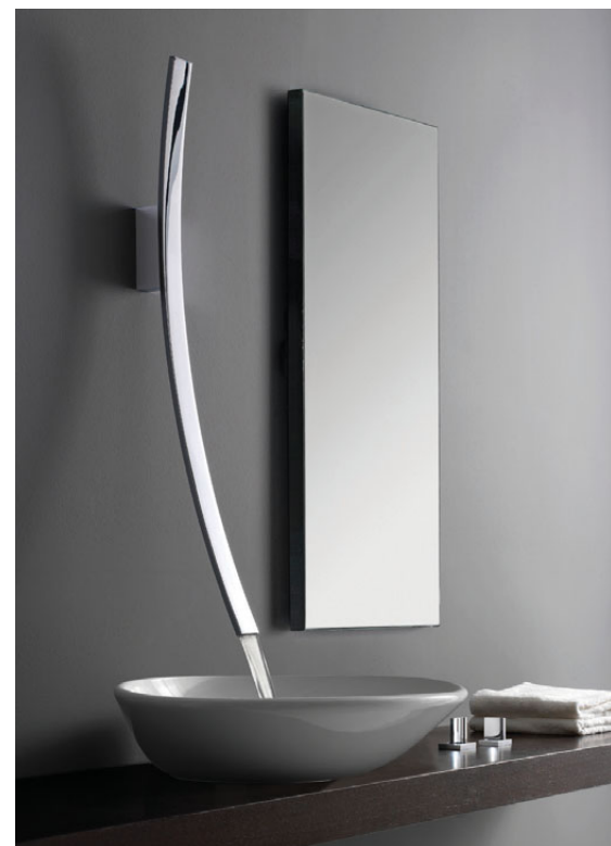
➔ Graff Luna

The use of wood, veneer along with stones for wall claddings, mirror