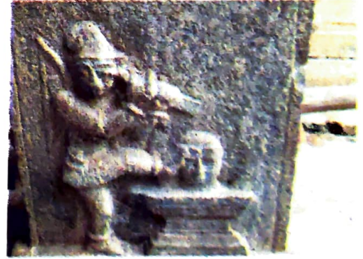
Vaidyeshwara temple complex; flowers as an offering to the gods

between the 4-10 century AD, Talakadu was subsequently ruled by the Cholas, Hoysalas and Wodeyars of Mysore.