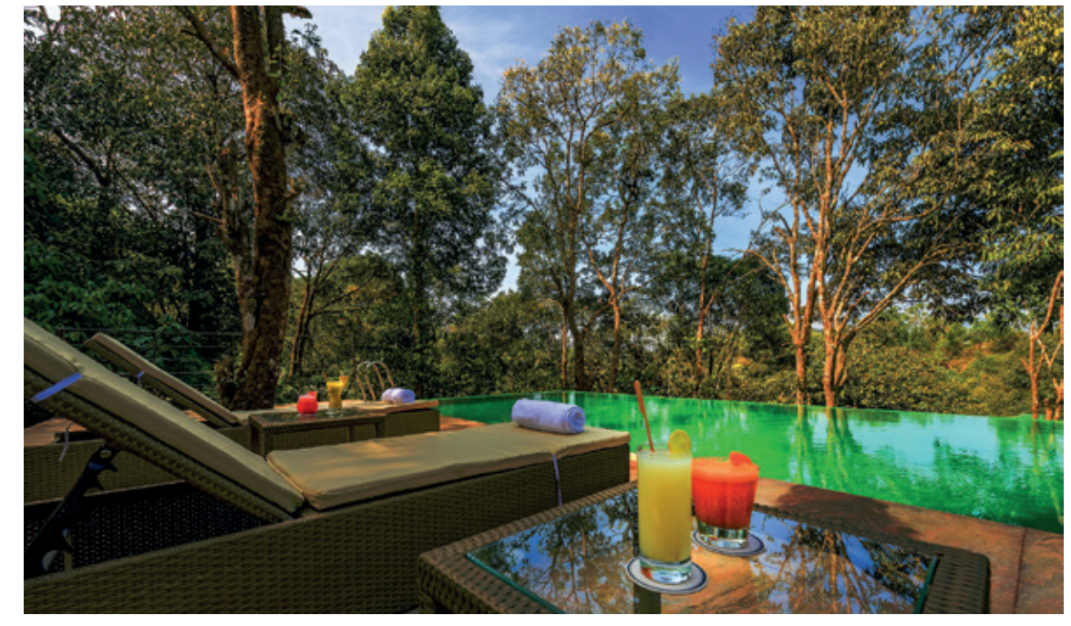
Wavanad Wild poolside

camping masters in South Africa, Sawai Shivir by TUTC tents are made of 100% canvas, setting them apart from other tented experiences in the region. Each private and intimate suite tent features ensuite bathrooms, private wooden decks, and the exclusive Presidential Suite Tent boasts a private plunge pool.