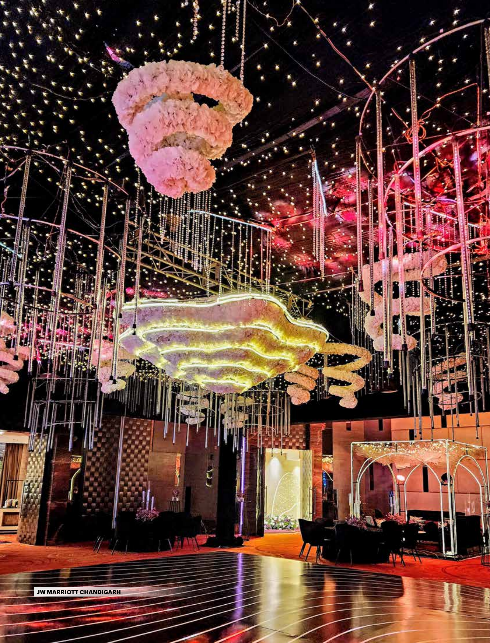
JW MARRIOTT CHANDIGARH