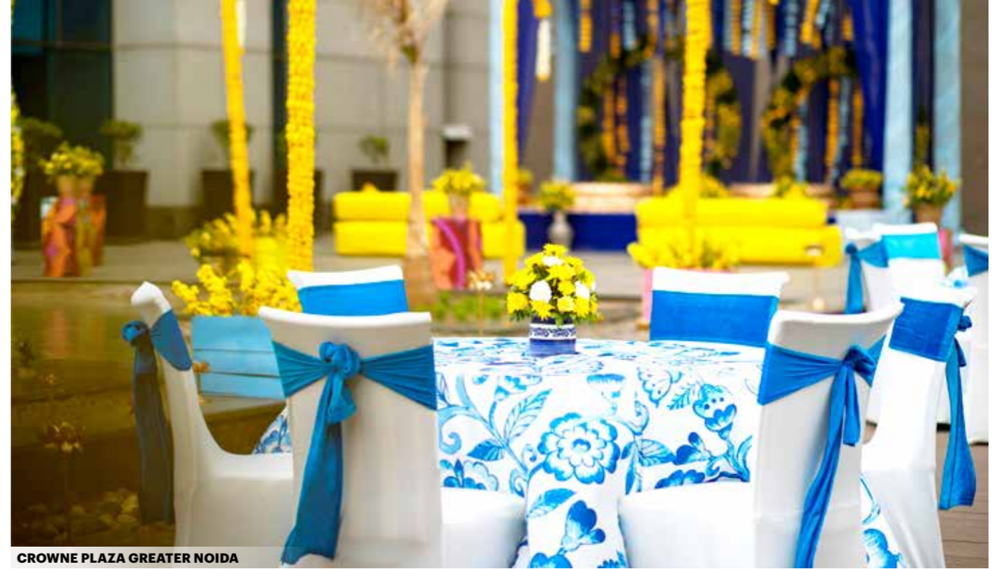
CROWNE PLAZA GREATER NOIDA

“CELEBRITY WEDDINGS APART, HOTELS ARE SLOWLY BECOMING THE PREFERRED CHOICE FOR WEDDINGS – WHETHER YOU WANT SOMETHING INTIMATE OR LAVISH, THERE ARE ALL KINDS OF HOTELS THAT CAN HELP YOU MAKE YOUR DAY SPECIAL.”