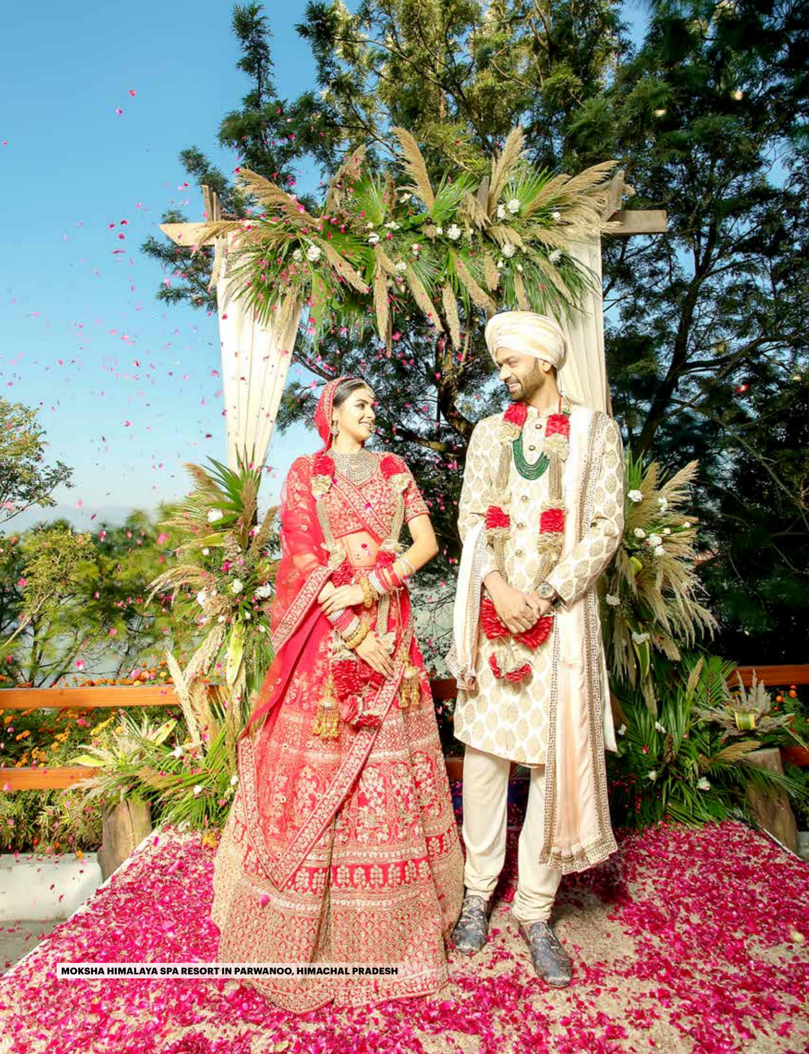
MOKSHA HIMALAYA SPA RESORT IN PARWANOO, HIMACHAL PRADESH