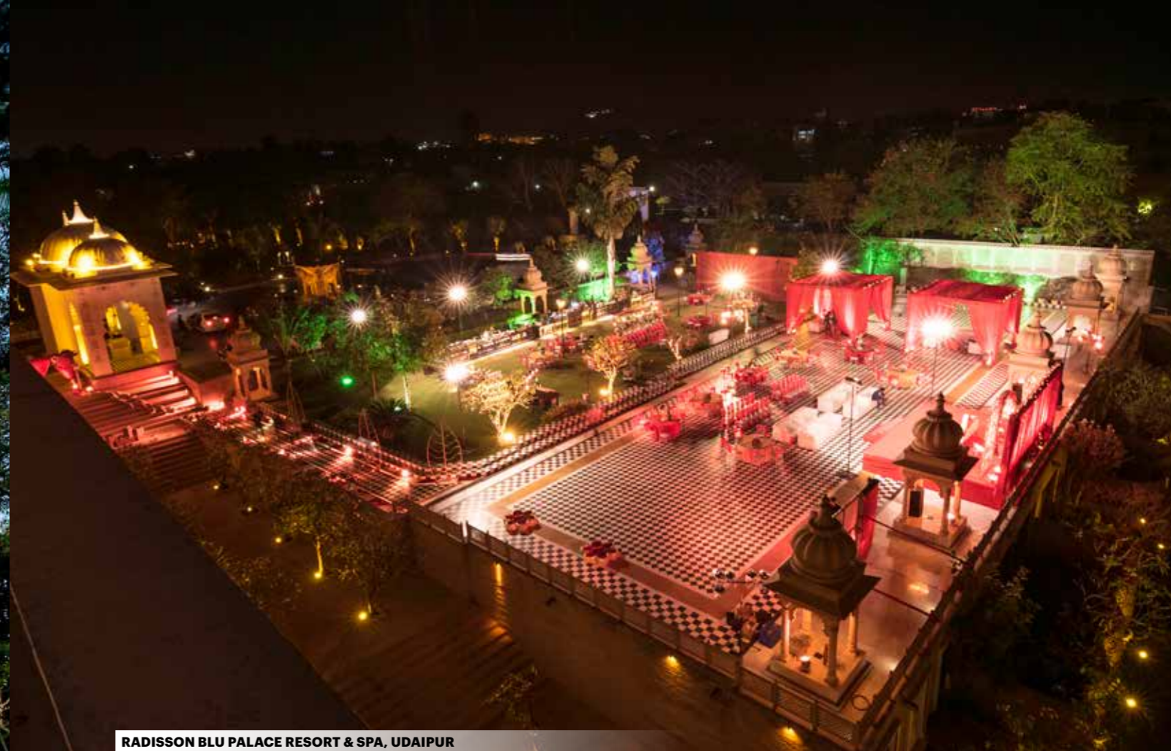
RADISSON BLU PALACE RESORT & SPA, UDAIPUR

“HOTEL VENUES ARE BEING METICULOUSLY DESIGNED TO OFFER INTIMATE LUXURY THAT GUARANTEE UNPARALLELED EXCLUSIVITY FOR EACH WEDDING HOSTED. TO ENSURE THAT EVERY MOMENT OF THE CELEBRATION IS NOTHING SHORT OF EXTRAORDINARY, THERE IS A TEAM OF EXPERTS DEDICATED TO CURATING UNIQUE AND PERSONALISED EXPERIENCES.”