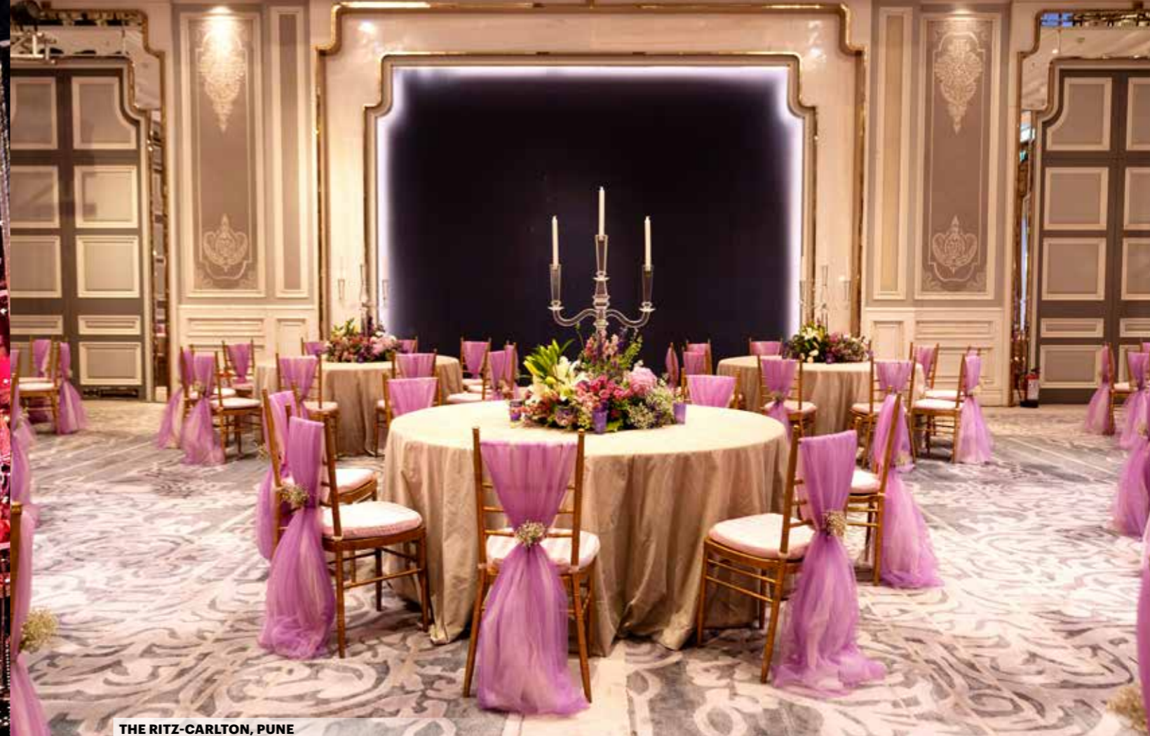
THE RITZ-CARLTON, PUNE

“HOTELS LIKE MARRIOTT HAVE CREATED WEDDING CONCEPTS LIKE SHAADI BY MARRIOTT BONVOY THAT PROMISE TO EXCEED EXPECTATIONS, WHETHER IT IS A GRAND GALA OR AN INTIMATE AFFAIR. WITH SEASONED IN-HOUSE WEDDING EXPERTS, EVERY ASPECT OF THE BRIDE, GROOM, AND GUESTS’ NEEDS ARE MET.”