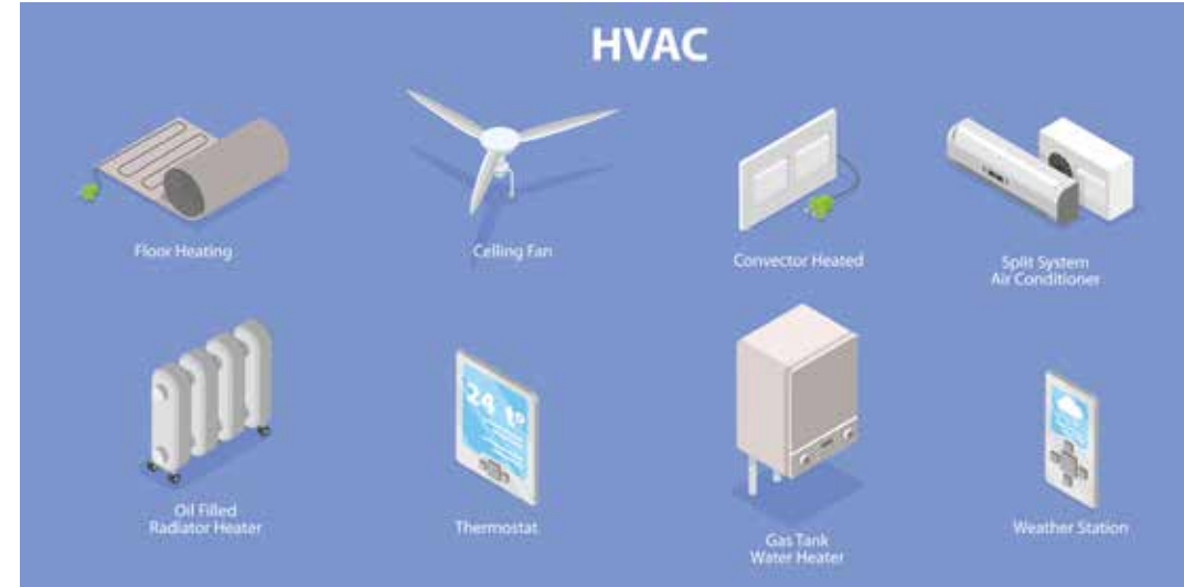
HVAC industry has actively transitioned away from refrigerants that cause Ozone depletion and adopted refrigerants with low Global Warming Potential.

by transcending geographical barriers. "The advanced technologies are also contributing to the enhanced automation of the systems for precise control of temperature, humidity, and other factors of the environment. Apart from this, the HVAC industry is progressing at a phenomenal rate by harnessing the benefits of collated data to practice predictive maintenance of the systems to troubleshoot and calibrate the systems to eliminate faults effectively that too in advance," adds Pahwa.