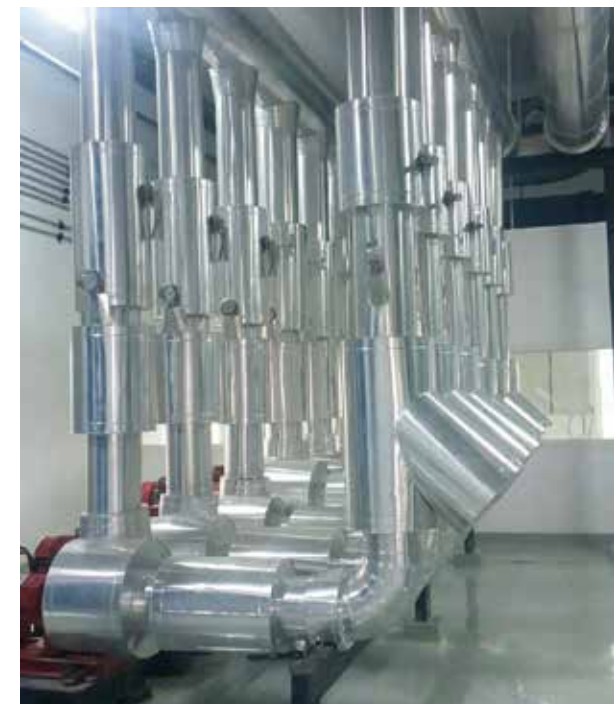
Smart controls, using Variable Frequency Drives (VFD), now have a crucial role in optimizing the performance of motors, including AC fan motors and compressors, in the HVAC industry

Rs 11.1 lakh crore for infrastructure in the 2024-25 budget has created a conducive environment for the HVAC sector's growth. HVAC plays a significant role in all infrastructure projects like Airports, Hospitals, Industrial premises, Warehousing, and the like. "The current government norms require all infrastructure designs to incorporate appropriate HVAC measures for a hygienic and comfortable environment. With modern infrastructural structures being built to be insulated and air tight to maximise energy efficiency, the provision of Ventilation and Air Conditioning plays a vital role to keep the space sustainable and hygienic," says Sachdev. A recent United Nations mandate advocates raising the set temperature of all air conditioning systems to 26 degrees Celsius in a concerted effort to mitigate power consumption. Authorities will provide devices to monitor adherence to the directive, and any failure to comply will attract penalties in the future. AI