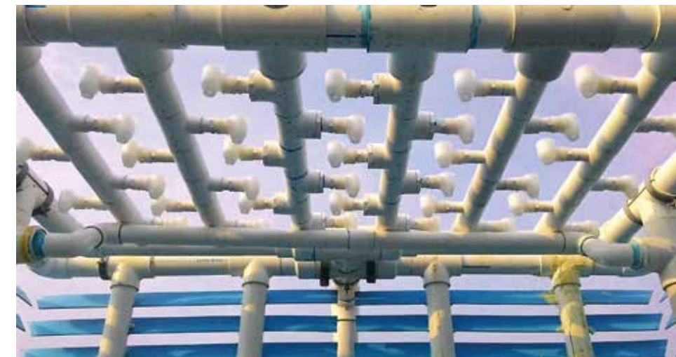
HVAC industry has actively transitioned away from refrigerants that cause Ozone depletion and adopted refrigerants with low Global Warming Potential.

The Indian government's substantial allocation of