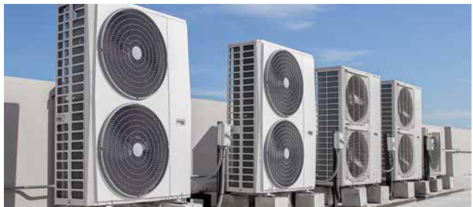
New innovations using magnetic refrigeration and thermoelectric refrigeration systems eliminate the need for these parts, and as a result, create more durable air conditioning systems

Boost in the Cooling industry is directly linked to the economic growth of the country. India is a developing country, and its cooling needs are ever-increasing. The government has taken a visionary step of drafting the India Cooling Action Plan (ICAP), which assesses the growing need for cooling across various industries while also realising the need for providing sustainable cooling. "ICAP provides 20 years of perspective of refrigerant-based cooling from 2017-18 to 2037-38. Nearly 70 percent of emissions is