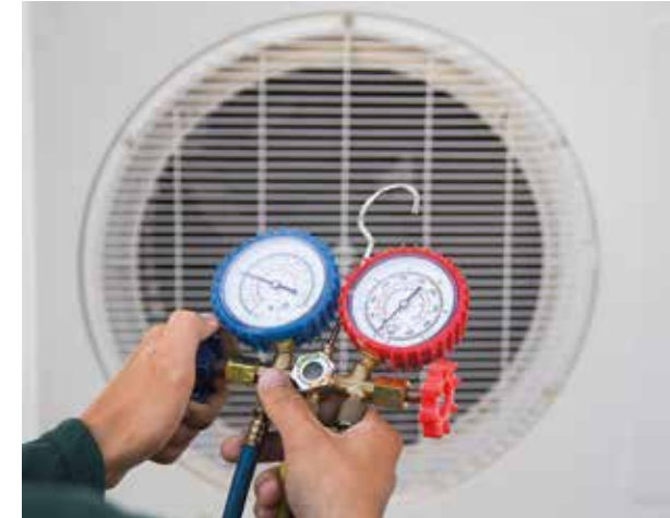
Conventionally, the air conditioning of an indoor space requires the usage of materials such as refrigerant gas, compressors, heat exchangers, copper/aluminium coils, and fans.