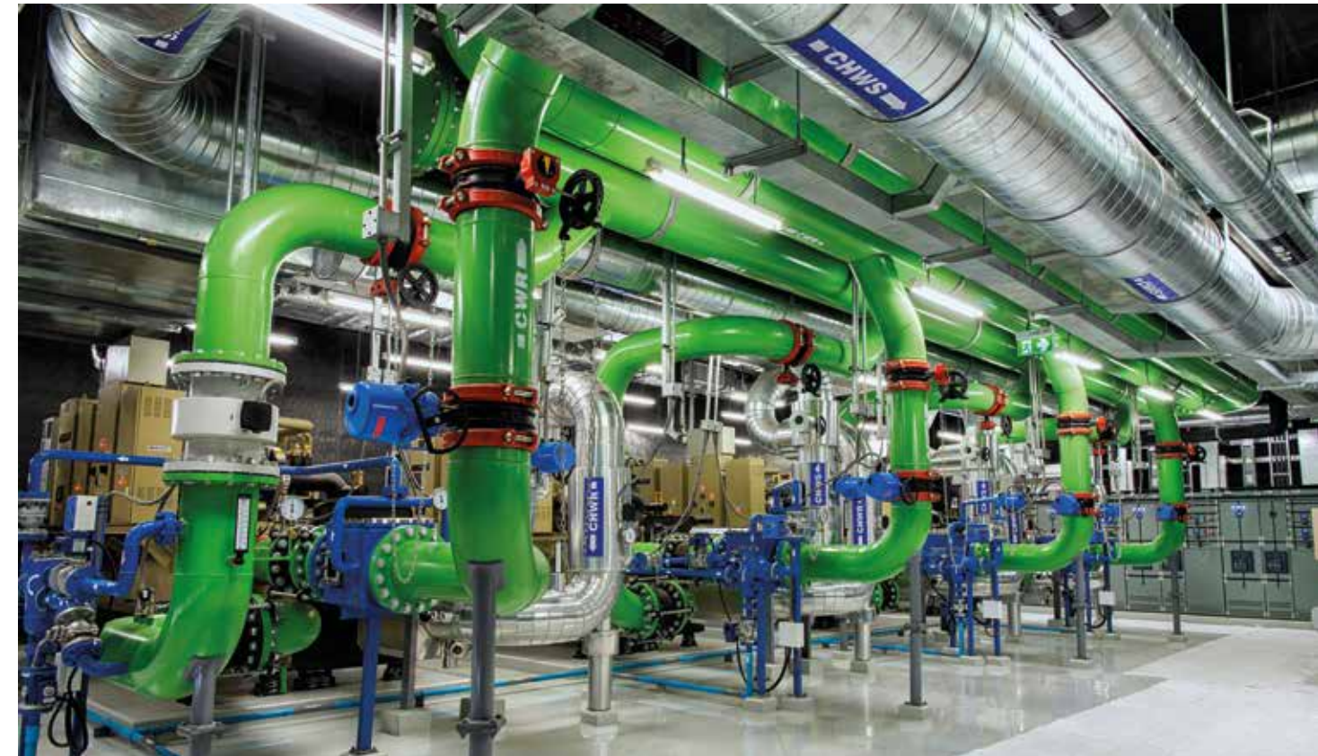
Driven by the growing importance of net-zero solutions in the segment, the industry is adopting energy-efficient solutions with alacrity to reduce the carbon footprint significantly.

Electronically controlled tankless water heaters that are systems that do not store any water, and heat water instantly on demand at the precise temperature, thereby maximising comfort and reducing water wastage are gaining traction. These water heating systems are electronically controlled where the power required to heat water is adjusted based on the flow rate and differential temperature of water, thus making these systems extremely energy efficient vis a vis traditional water heating system. "Traditional Air to Water heat pumps use only the power of the heat pump compressor to heat the water. Although heat pump water heaters are environmentally friendly, the time taken to heat water in varied weather conditions make them un-reliable.