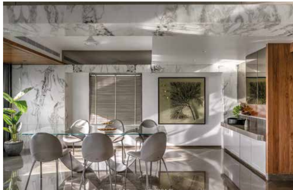
Beyond Alliance offers smart home solutions that are aesthetic and fuse with the decor as much as the lifestyle.

solutions for smart, intelligent, and sustainable homes. The company has launched the upgraded Wiser 2.0 smart home automation solution, which offers enhanced comfort and convenience along with advanced energy management capabilities. It has also launched the new Miluz Lara, a wiring device range comprising switches, sockets, and