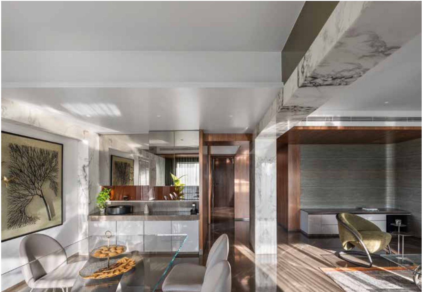
Automated systems allow for effortless control of lighting, temperature, and security remotely, optimising energy usage and reducing utility costs.

They help manage life better. “A home that thinks for us is a far more comfortable space than having brainless switches across the space. Comfort comes from tuning lights and temperature to suit us. Comfort comes from understanding what we need, even without being commanded. Comfort comes through these automated sweet nothings fed into the system per each user’s tailor-made needs,” says Maulik.