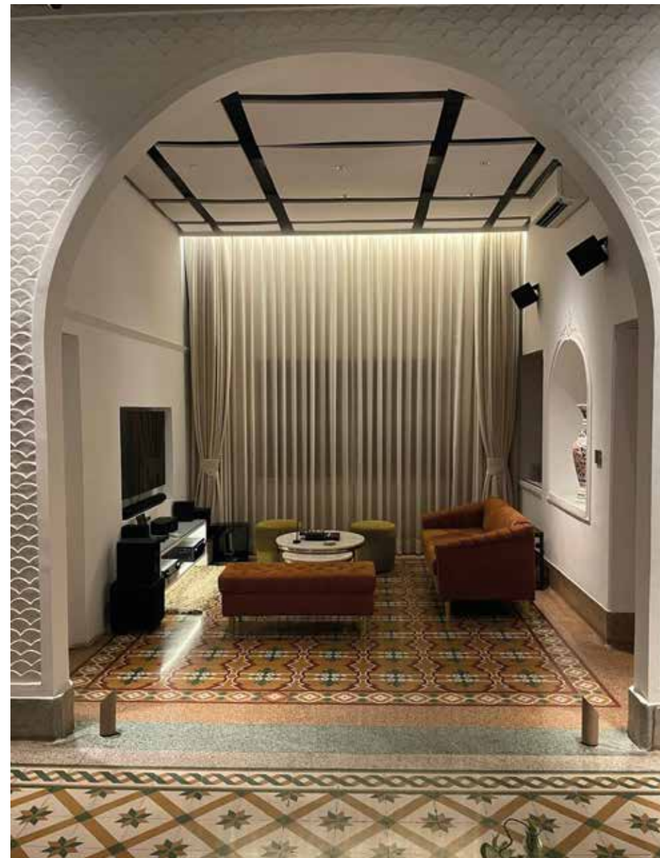
Homeowners today are becoming increasingly tech-savvy and are seeking abodes equipped with advanced automation solutions for convenience, safety, and energy management.