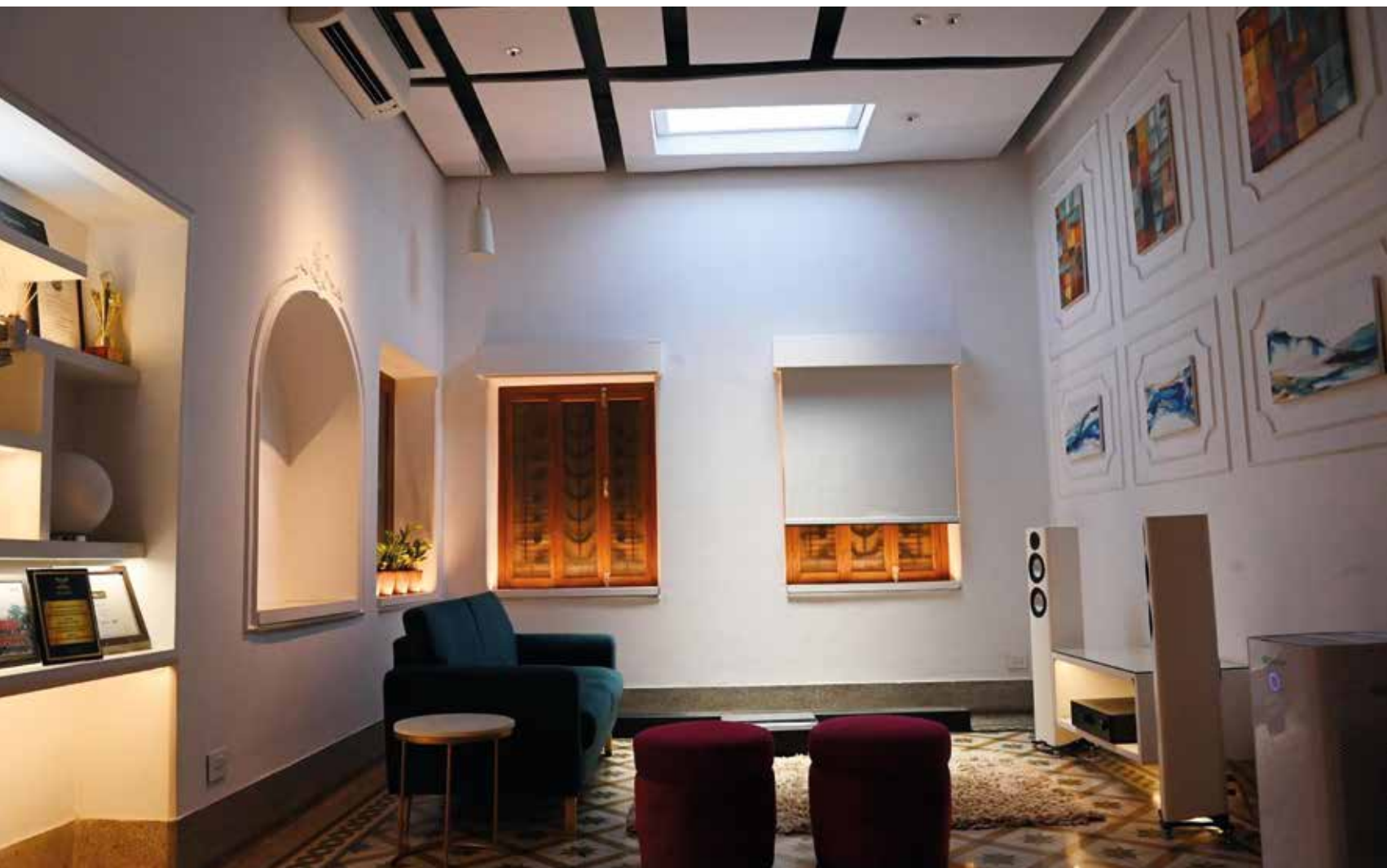
Automated lighting, and HVAC systems, contribute to energy conservation by minimising unnecessary usage and add to the aesthetics.