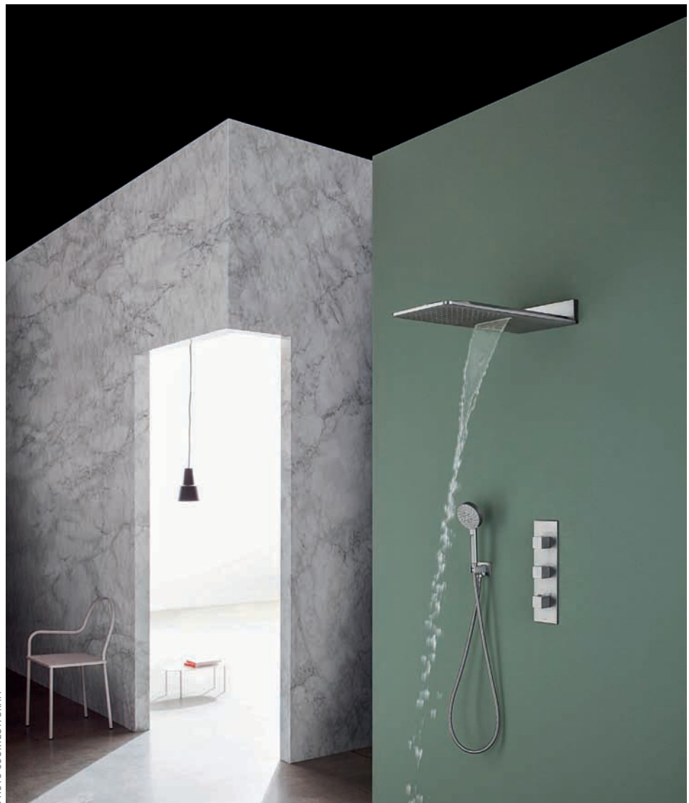
Shower consoles designed for both adults and children, offer a luxurious and customizable showering experience, while also being easy to install and aesthetically pleasing.