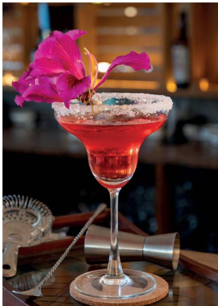
Cocktail at WelcomHeritage Cheetahgarh

rum). These bespoke elements help craft unique flavours that you can't find anywhere else. Each cocktail is carefully crafted, with bartenders often using techniques such as shaking, stirring, muddling, and even barrel-aging ingredients to enhance flavour. Some cocktails are infused for extended periods, allowing the flavours to meld in a way that produces complex, distinctive drinks. Cold-pressing, where fruits or herbs are pressed to extract juice without heat, is another method we use to maintain the integrity of flavours."