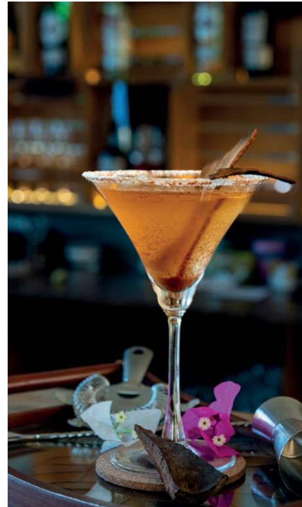
At WelcomHeritage Cheetahgarh, the menu features unique cocktails where local ingredients are used to highlight the flavours found in the local cuisine and culture