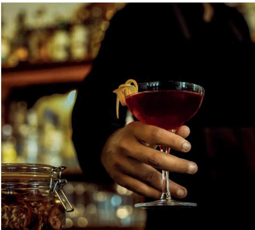
Brunton Boatyard's Armoury Restobar curates a cocktail menu inspired by regional flavors, sourcing spices from iconic locations like the Mattancherry spice market and fresh, seasonal ingredients from nearby producers

Hotels are redefining the bar experience with artisanal cocktails by using house-infused and crafted cocktails that speak to creativity and local flavour. Park Inn by Radisson IP Extension, New Delhi uses fresh regional ingredients plus a house-made element, such as unique infusions and syrups, from smoked chilli to exotic teas, all for great flavours. Modern fermentation and items such as kombucha and shrubs add unique taste profiles. Artisanal cocktails have always generated a buzz in the niche category of new drinks. Techniques like fermentation, mixed with molecular mixology are sending waves among bartenders. Customisable cocktails offer a personal touch that guests appreciate, while social media amplifies the appeal of visually stunning beverages. “The focus is on both the science and