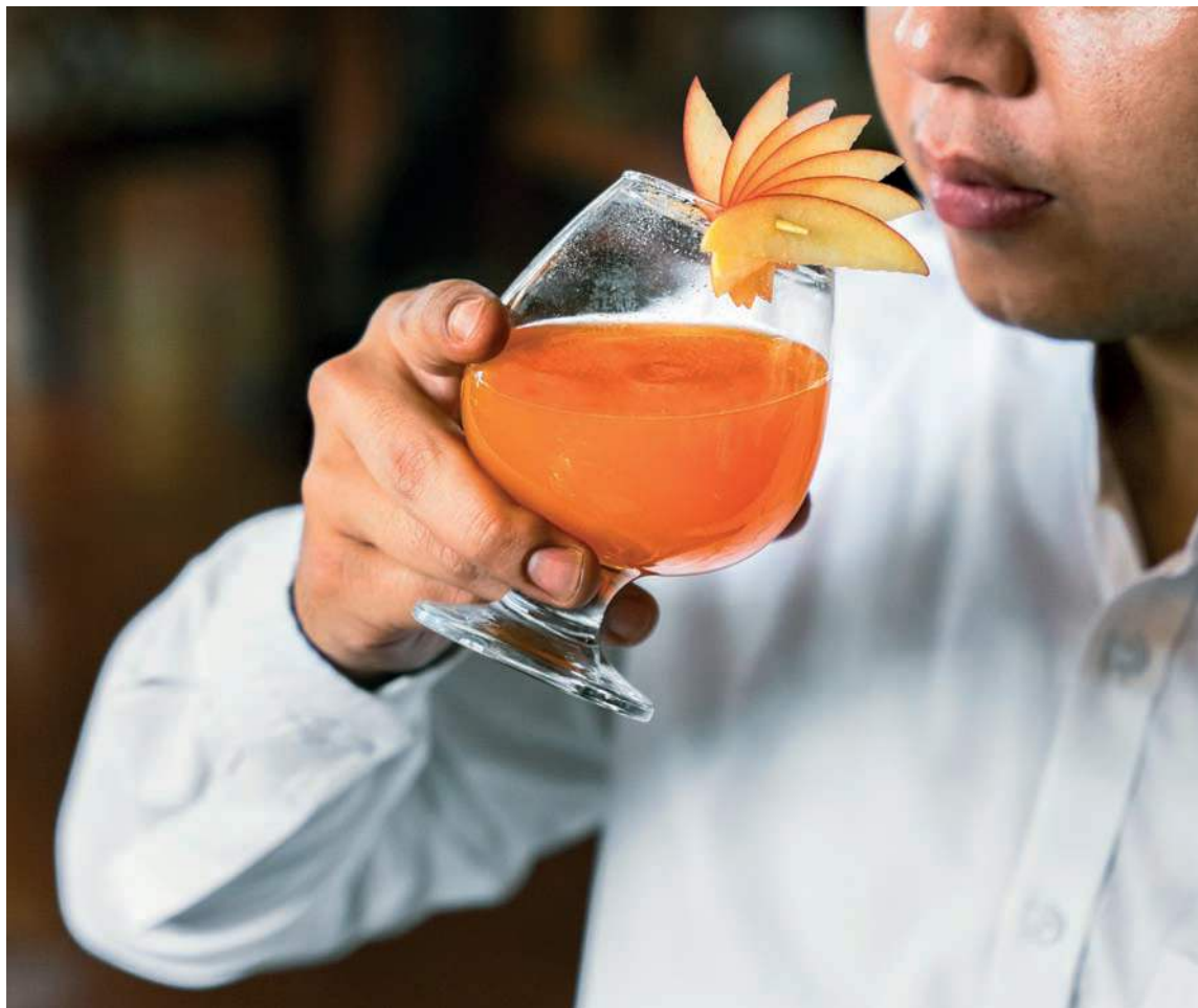
Cocktail at CGH Earth Brunton Boatyard