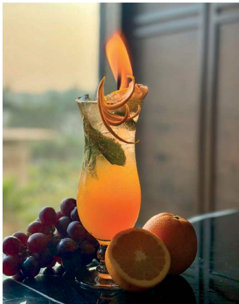
Cocktail at Taj Lakefront Bhopal