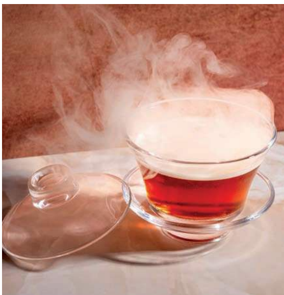
Idduki Cardamom Sour from ITC Maurya New Delhi