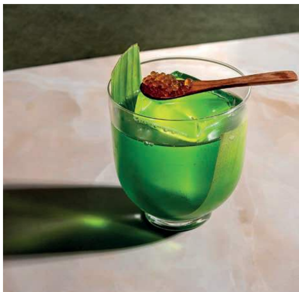
Right Munnar Chai Punch from ITC Maurya New Delhi