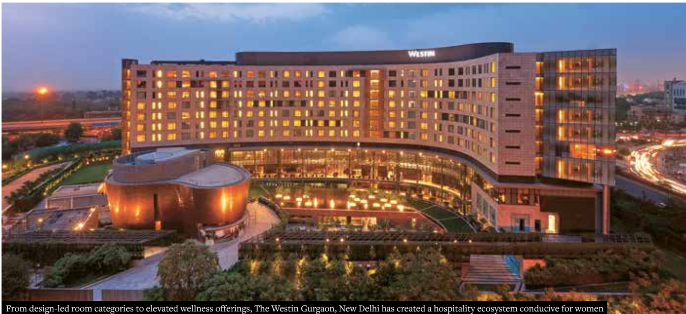
From design-led room categories to elevated wellness offerings, The Westin Gurgaon, New Delhi has created a hospitality ecosystem conducive for women