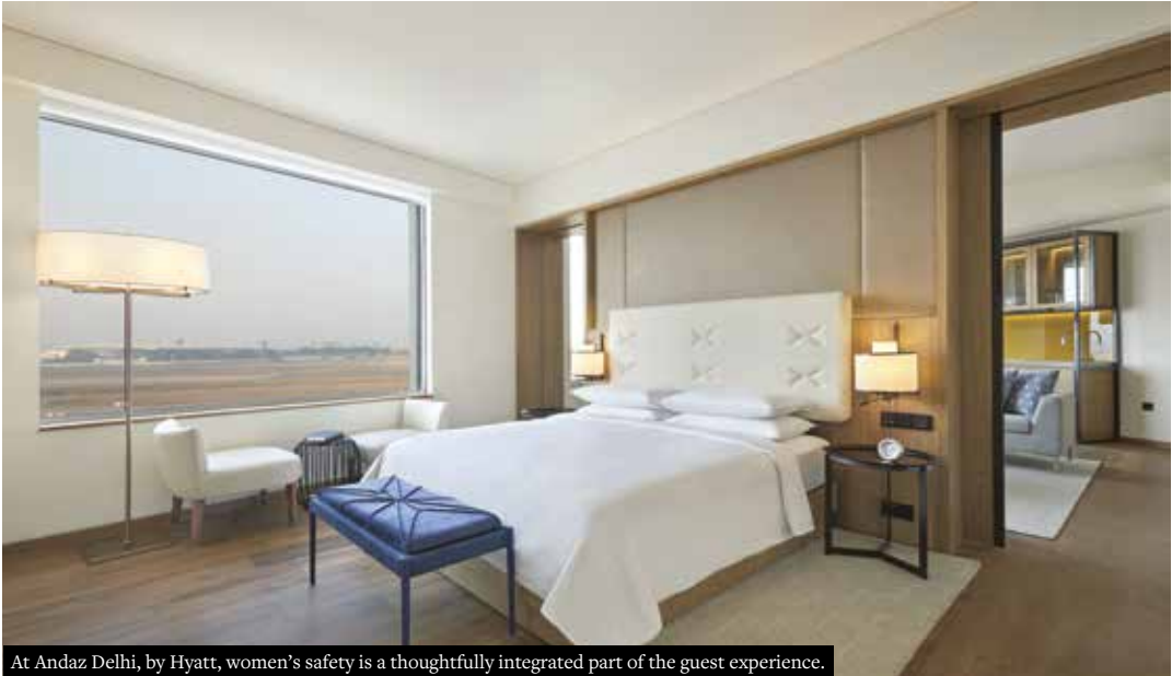
At Andaz Delhi, by Hyatt, women’s safety is a thoughtfully integrated part of the guest experience.