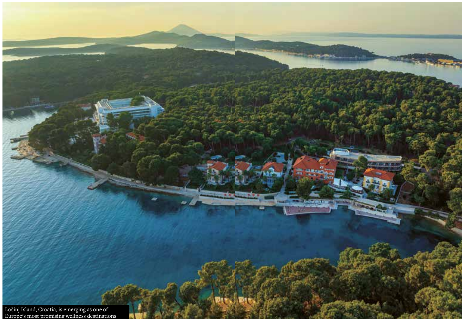
Lošinj Island, Croatia, is emerging as one of Europe’s most promising wellness destinations