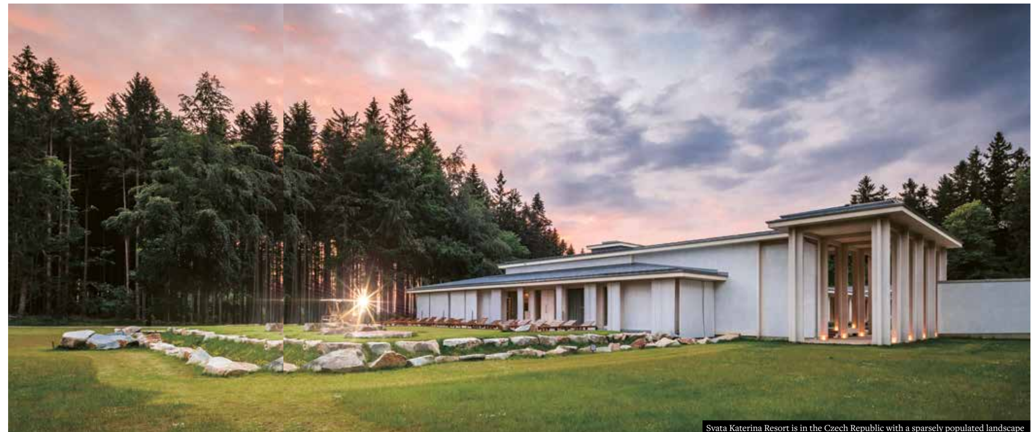
Svata Katerina Resort is in the Czech Republic with a sparsely populated landscape