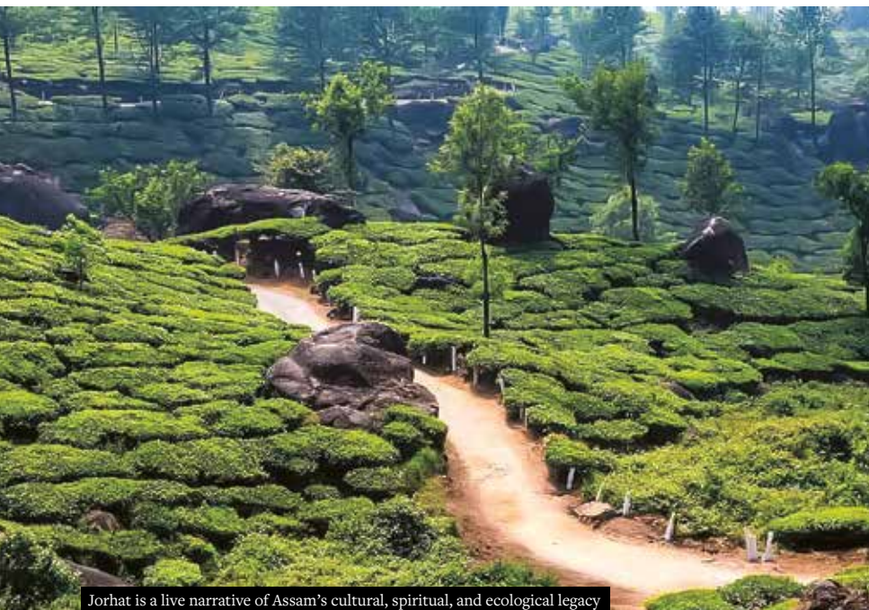
Jorhat is a live narrative of Assam’s cultural, spiritual, and ecological legacy

Gurez Valley is a place where nature and history come together and silence speaks in powerful undertones. It was once an important route on the ancient Silk Road, connecting cultures, trade, and people. However, today, it remains a secluded