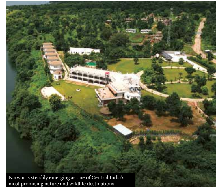
Narwar is steadily emerging as one of Central India’s most promising nature and wildlife destinations

Lošinj Island, Croatia, is emerging as one of Europe’s most promising wellness destinations, celebrated for its healing microclimate, pristine Adriatic setting and century-old health tourism legacy.