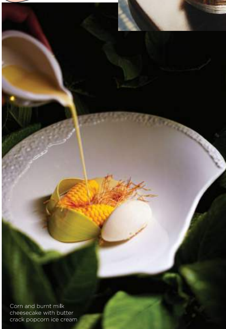
Corn and burnt milk cheesecake with butter crack popcorn ice cream

and Japanese cheesecakes continue to be popular, there is a growing movement towards what many chefs call 'third-culture desserts', creations that blend Japanese techniques and ingredients with influences from around the world," mentions Debolina Datta, Junior Sous Chef, Tomo Kei, Sheraton Grand Bengaluru Whitefield Hotel and Convention Centre.