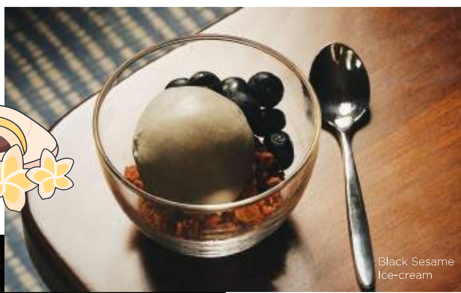
Black Sesame Ice-cream