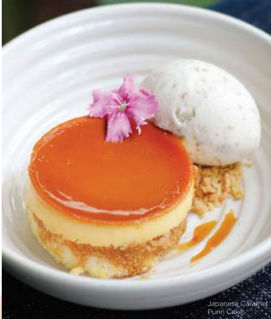
Japanese Caramel Purin Cake

Wagashi, the Japanese sweets she refers to, are more like confectionery than the puddings and pastries found in many other cuisines. They evolved alongside the Japanese tea ceremony as bite-sized sweets designed to balance the bitterness of tea. Japanese desserts encompass both these traditional confections and more modern creations that emerged through Western influence. “As a result, they tend to be simpler than the elaborate desserts one might find in other cultures. They are delicate and have a sense of purity about them,” explains Kably.